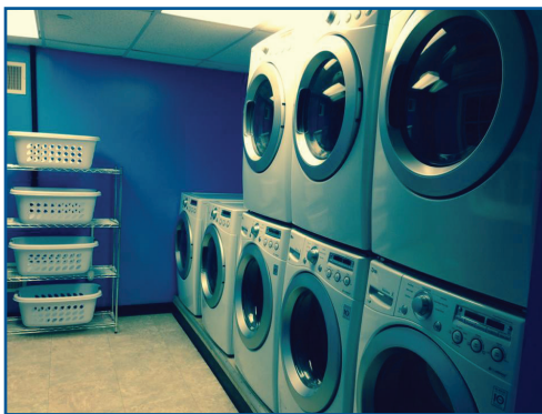
The Mothers Club donated new laundry room equipment, adding to the exciting changes at Xi Xi.

More change is coming in the expansion of our communications to alumni, parents and university personnel. In a grand step toward the 21st century, we will soon introduce a new Xi Xi website to give our target audiences a constant resource for news. We will be sending you information on website contact when it goes online.