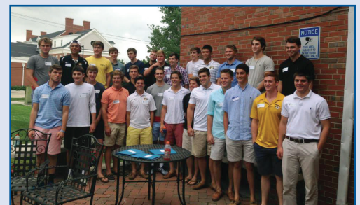
The new members learned more about Sigma Chi from a panel of alumni, Chapter officers, and Greek Life representatives at the New Member Orientation in August.

Xi Xi prides itself on education and support not only for members, but for parents as well, with full transparency in all Chapter-related issues. Parents are always encouraged to join groups, ask questions, and to express concerns and contact any Chapter officers, alumni, board members, or the house director when they arise. As always, our goal is to make the fraternity experience productive, safe and supportive. The orientation is the first step for parents and new members to achieve that goal.