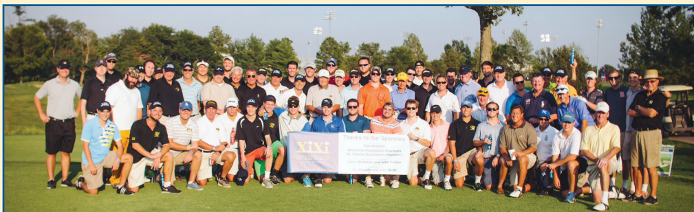
The annual golf tournament grew to 66 participants.