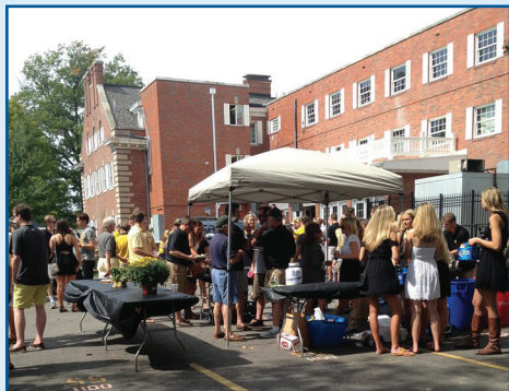
A crowd gathers at the Mothers Club Family Weekend tailgate.