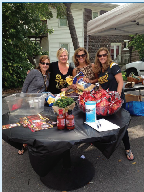
Members of the Mothers Club prepare food at the tailgate on September 20.