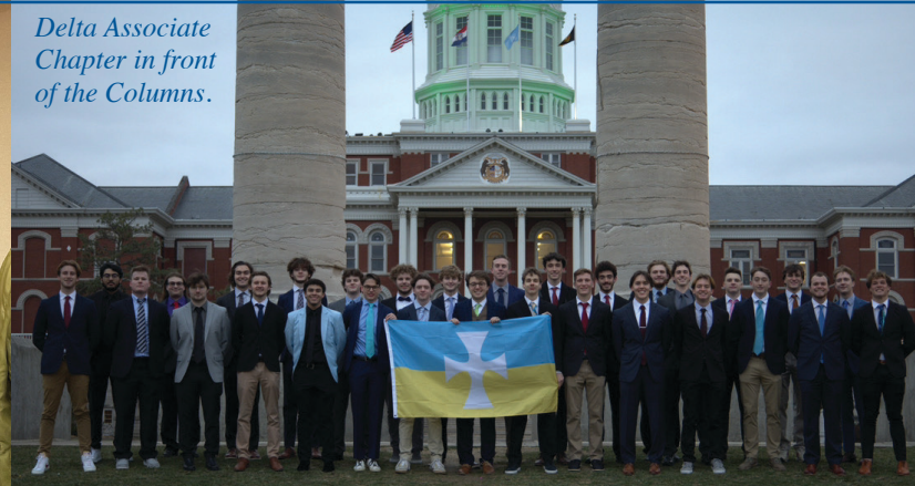
Delta Associate Chapter in front of the Columns.