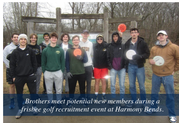
Brothers meet potential new members during a frisbee golf recruitment event at Harmony Bends.