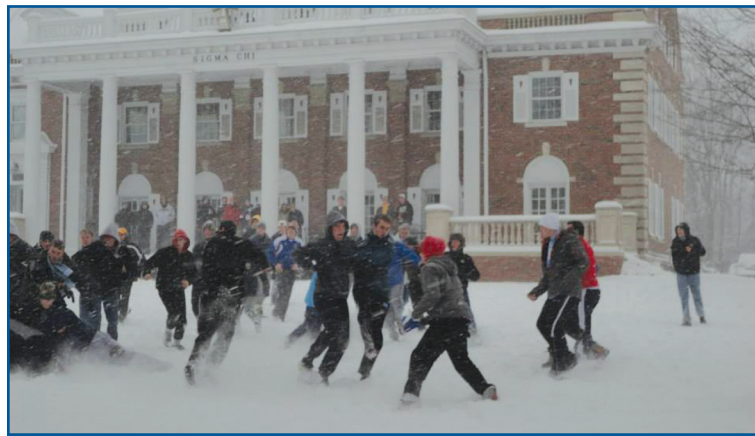
Members celebrate a snow day at Mizzou with a game of football on the front lawn.