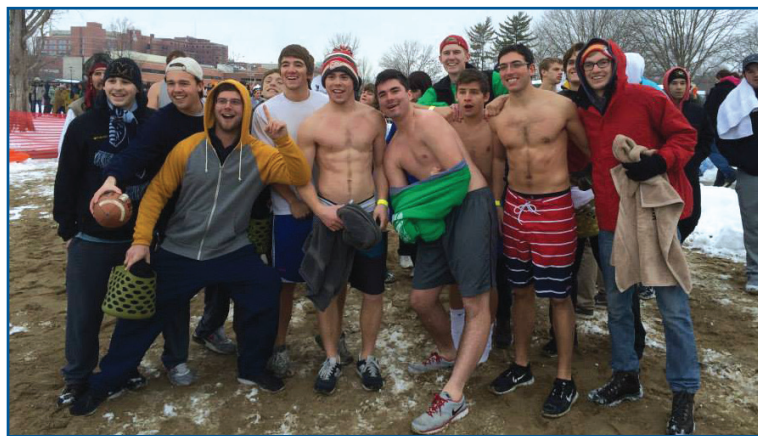
Sigma Chi was once again the leading donator at Columbia's annual Polar Plunge, where members volunteer to jump in the frigid waters at Stephen's College Lake, raising $7,000.